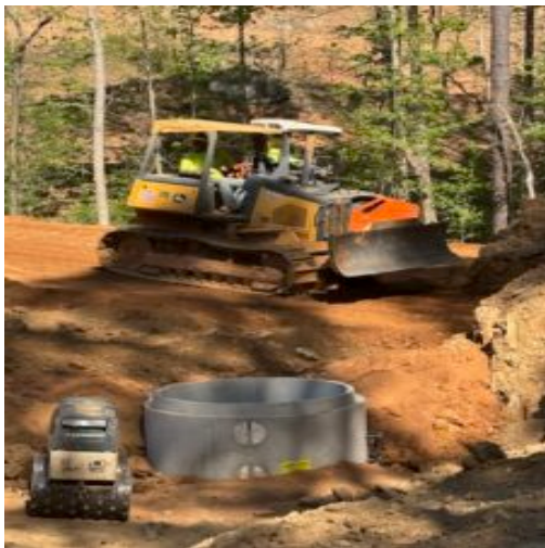
Fill placement and compacting efforts

We appreciate the opportunity to be of service to you on this project. If you have any questions regarding this report, please feel free to contact us. We will be more than happy to discuss it with you.