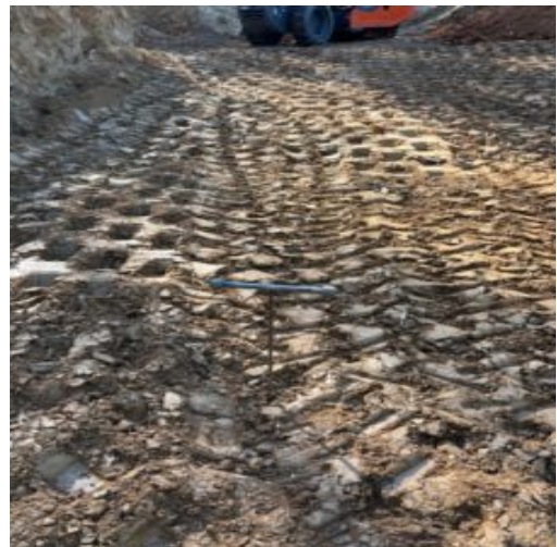
Fill placement and compacting efforts