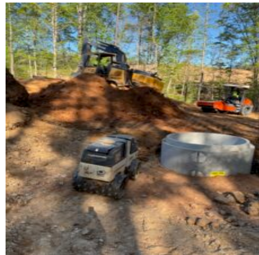
Compacting efforts using vibratory sheet foot rollers