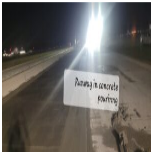
Picture depicting entire runway covered by concrete pouring

We appreciate the opportunity to be of service on this project. Should you have any questions regarding this report, please do not hesitate to contact us. We would be pleased to discuss our findings further.