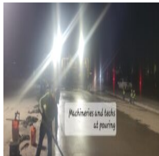
Picture showing concrete pouring multiple machines and crewmen