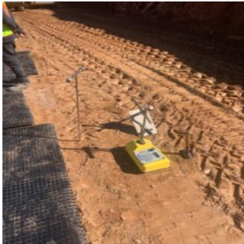
Performing density test using Nuclear gauge

We appreciate the opportunity to be of service to you on this project. If you have any questions regarding this report, please feel free to contact us. We will be more than happy to discuss it with you.