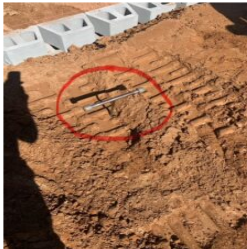
Probe rod showing depth of fill placement