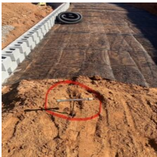
Probe rod showing depth of fill placement 16" to 24"