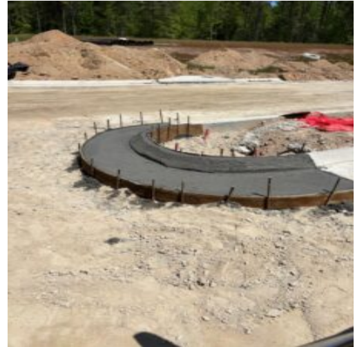
Pouring radius curbing