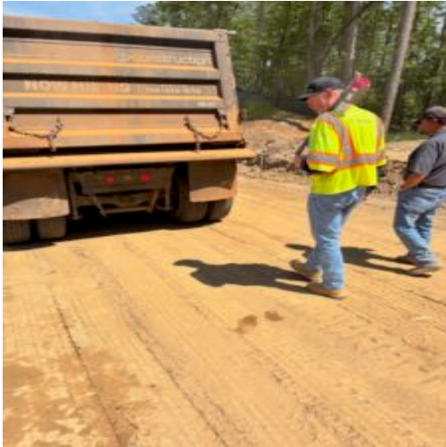
Proof rolling sub grades