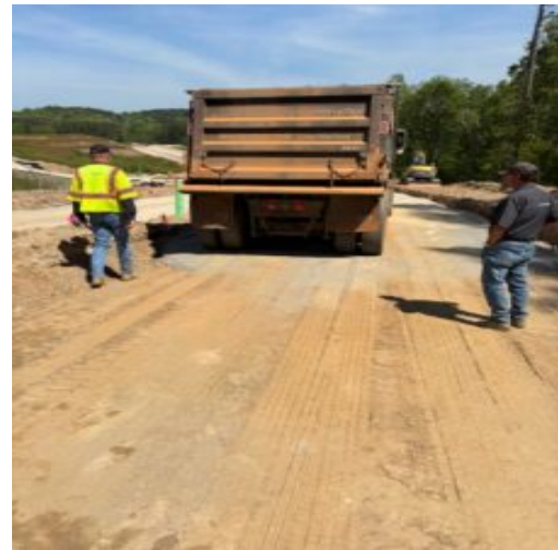
Proof rolling of sub grade