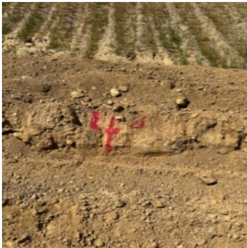
Area requiring 4" clip

We appreciate the opportunity to be of service to you on this project. If you have any questions regarding this report, please feel free to contact us. We will be more than happy to discuss it with you.