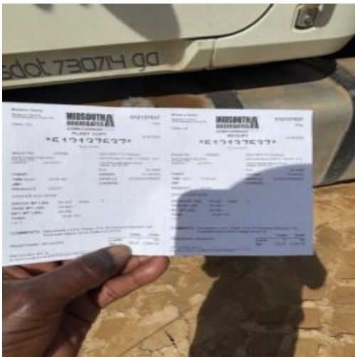
Proof roll ticket 19.29 tons

We appreciate the opportunity to be of service to you on this project. If you have any questions regarding this report, please feel free to contact us. We will be more than happy to discuss it with you.