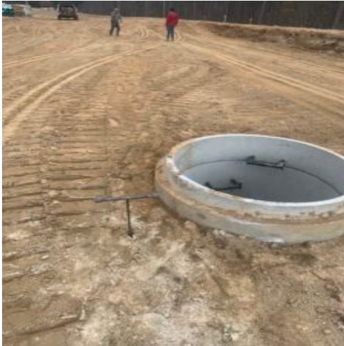
Loose compacted areas around manholes