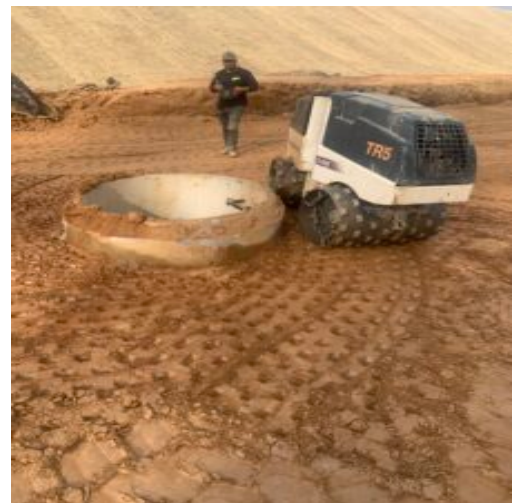
RE compacting efforts around manholes