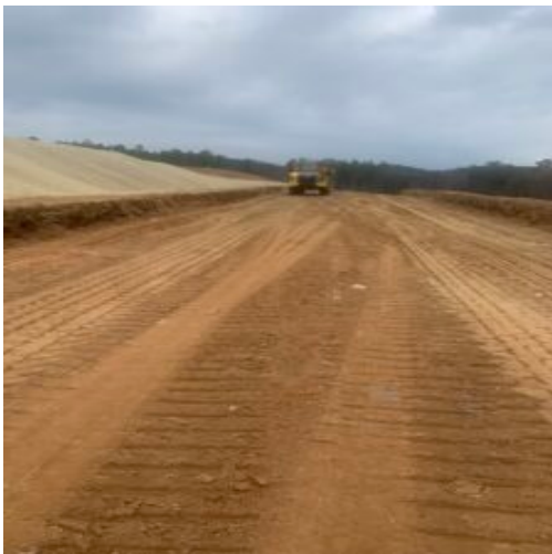
Sub grade prep at Nature Walk Parkway

We appreciate the opportunity to be of service to you on this project. If you have any questions regarding this report, please feel free to contact us. We will be more than happy to discuss it with you.