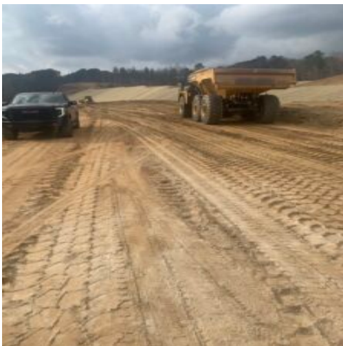
Sub grade prep