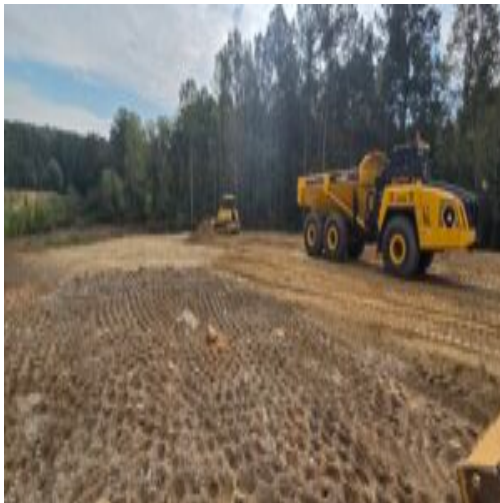
road way leading to bridge