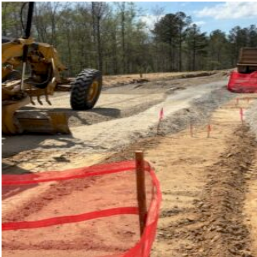
Subbase prep.at Nature Walk Pkwy. between sanitary sewer #4 and6

We appreciate the opportunity to be of service to you on this project. If you have any questions regarding this report, please feel free to contact us. We will be more than happy to discuss it with you.