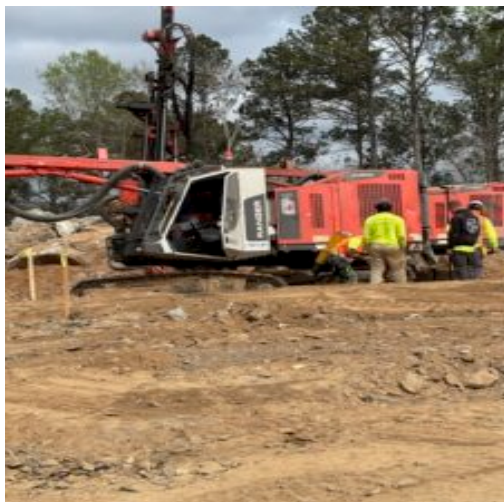
Drilling at unit4 phase 2