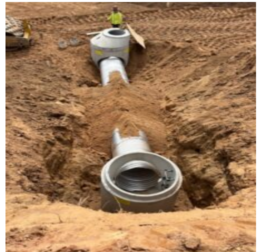
Installation of 36"cmp storm between A4 and A5