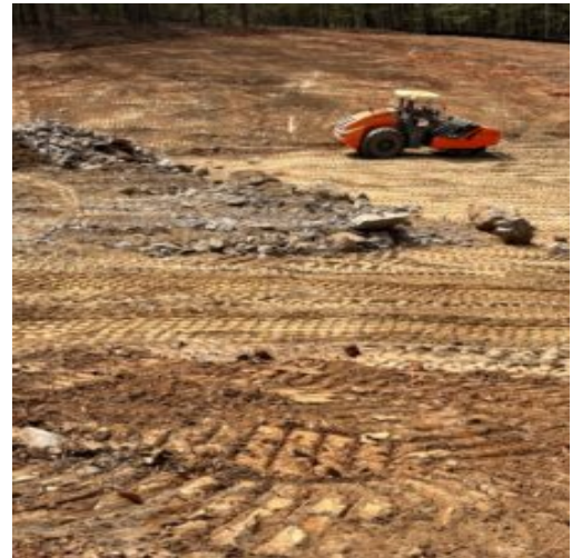
Rock fill placement at unit 4 phase 3