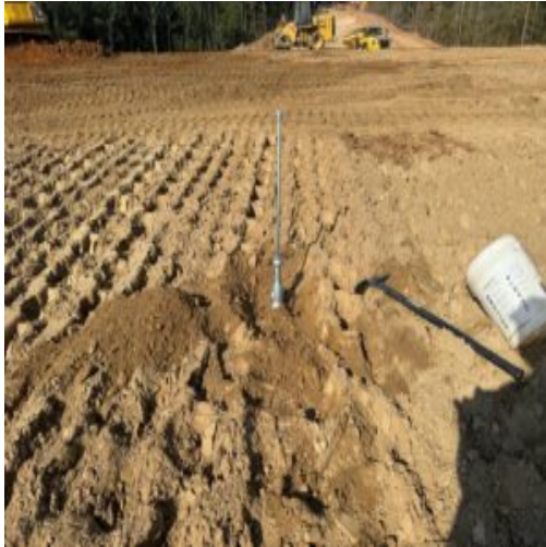
driven cylinder tests in lots