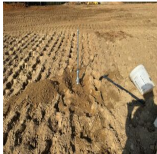
driven cylinder tests in lots