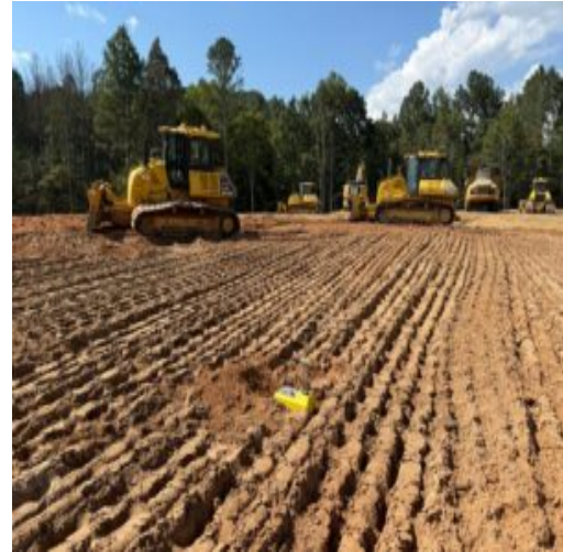
Embankment work in lots