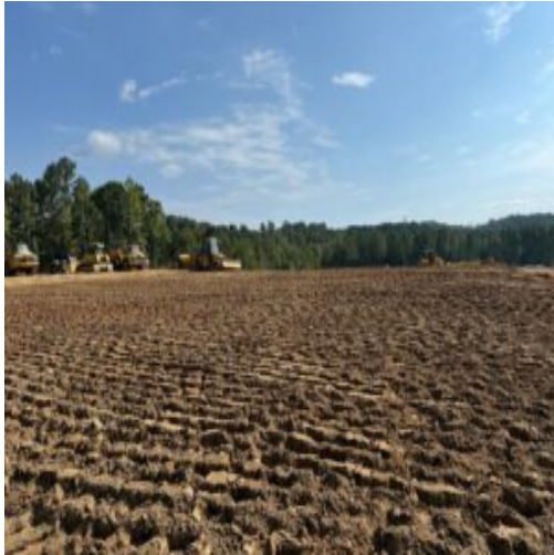
Embankment work in lots