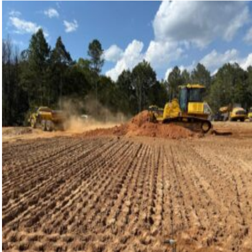
Embankment work in lots