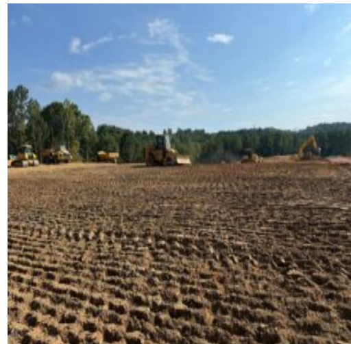
Embankment work in lots