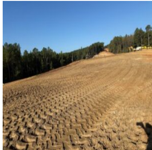
Back filling in lots