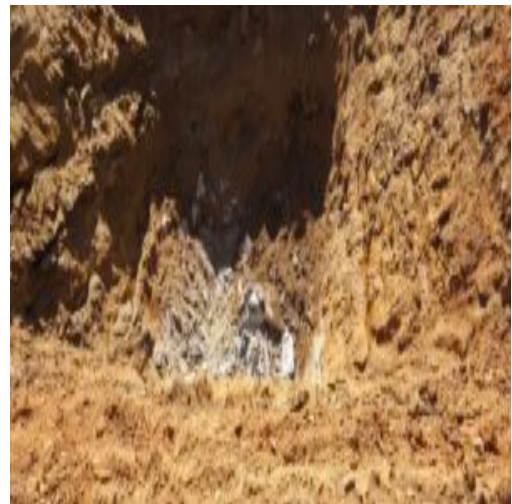
pump station foundation/footing