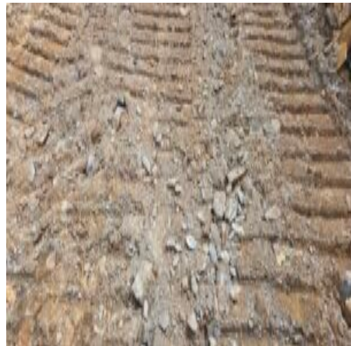
PWR in wall 1 footing