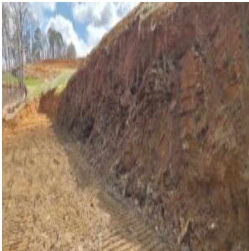
footing for wall 1 PWR present