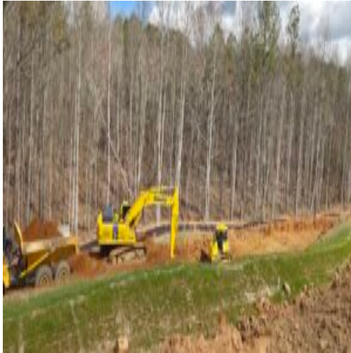
footing wall 1 excavation