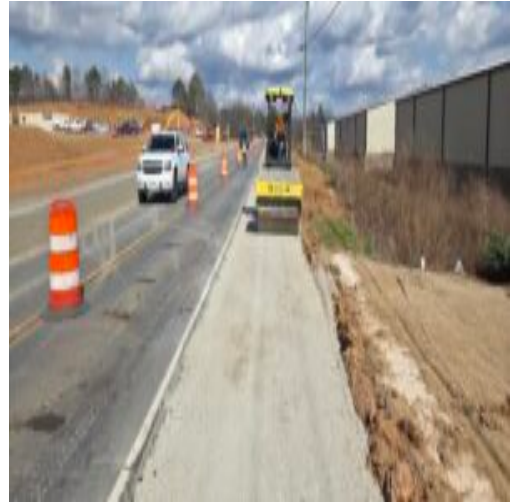
gab on extension