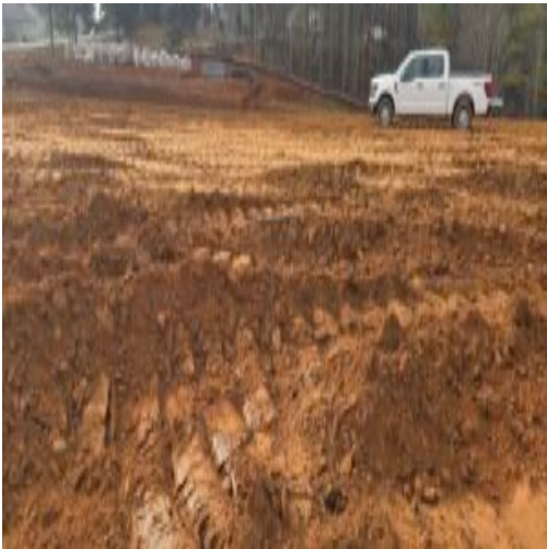
pumping area addressed by contractor

We appreciate the opportunity to be of service to you on this project. If you have any questions regarding this report, please feel free to contact us. We will be more than happy to discuss it with you.