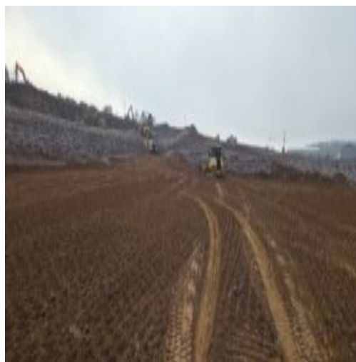
8 - 13 and 52 - 60 area, contractor removing pumping ground