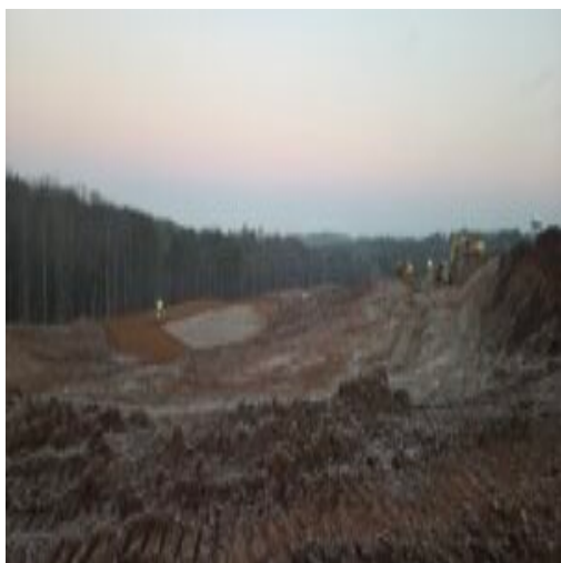
frozen ground being stripped