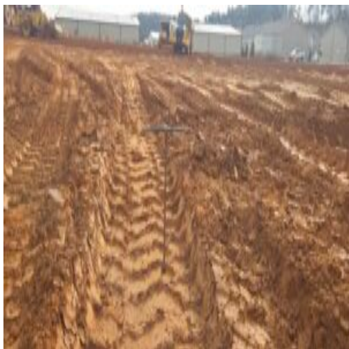
pumping area addressed by contractor