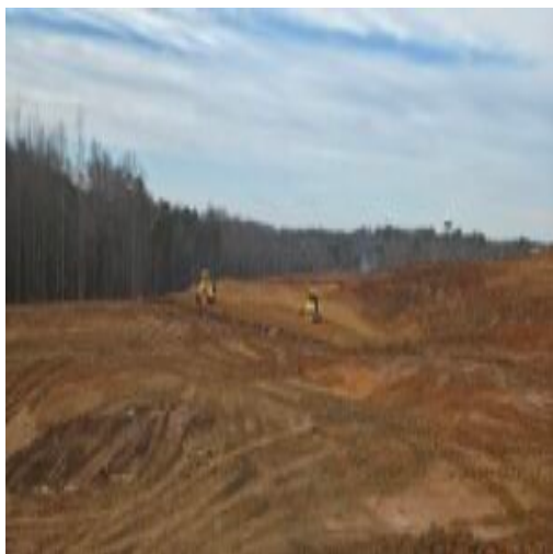
8 - 13 and 52 - 60 area