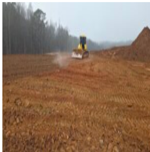
commercial lot area

The results presented in this report relate only to the items tested. This report shall not be reproduced, except in full, without written approval from AS Engineering and Consulting LLC.