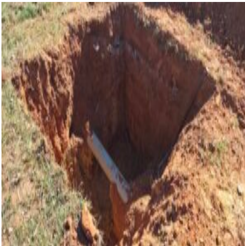
water main on Philadelphia road