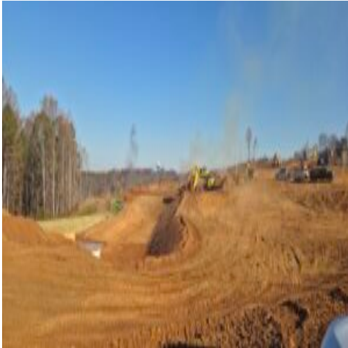
front detention pond