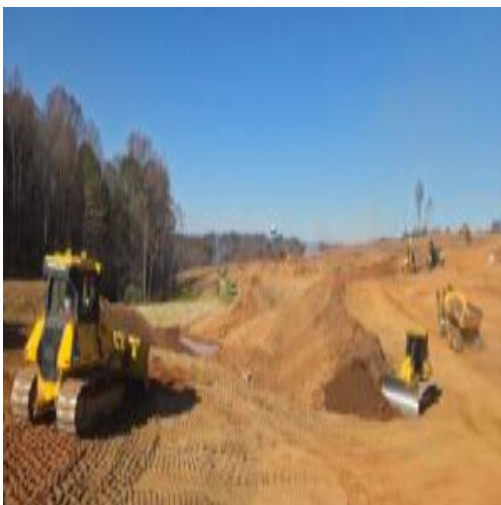
front detention pond

We appreciate the opportunity to be of service to you on this project. If you have any questions regarding this report, please feel free to contact us. We will be more than happy to discuss it with you.