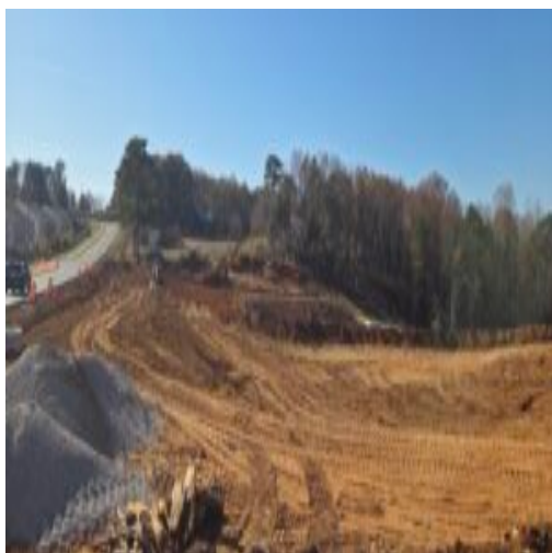
lot #1 - #4 area