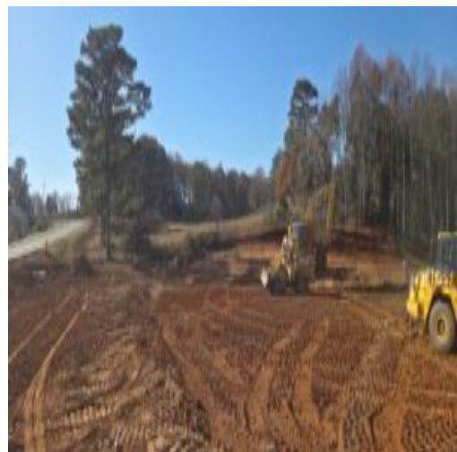
lot #1 area