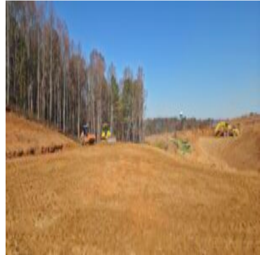
lot #1 - #4 area