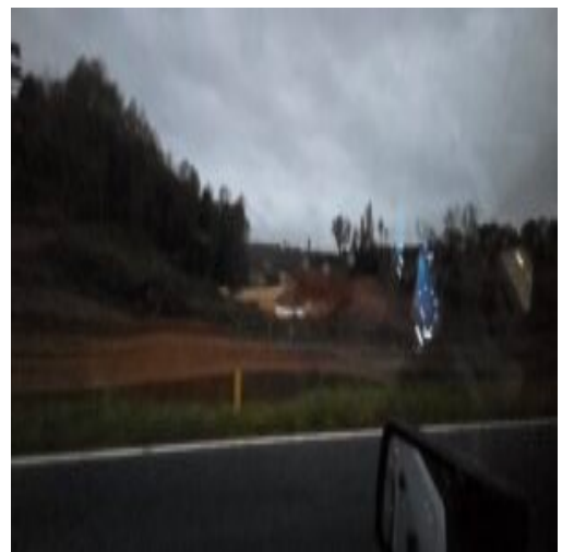
pond by entrance filled with water