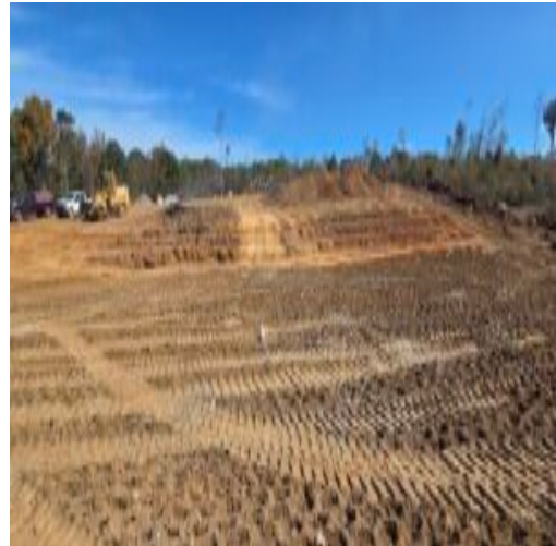
lots 22 - 25