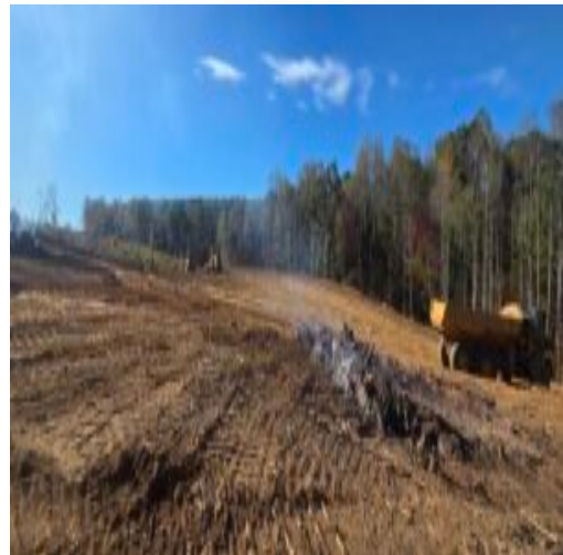
lots 22 - 25