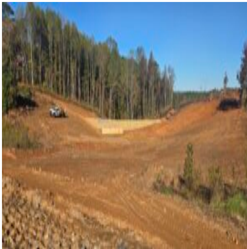
front pond by deceleration lane

We appreciate the opportunity to be of service to you on this project. If you have any questions regarding this report, please feel free to contact us. We will be more than happy to discuss it with you.