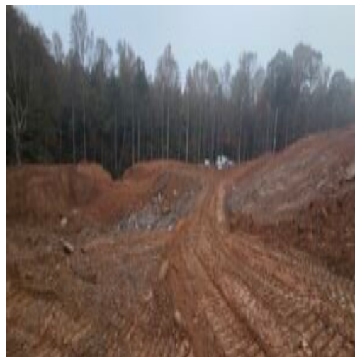
blasted rock fill