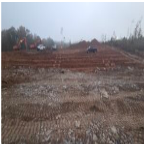
benching into slope for blasted rock fill