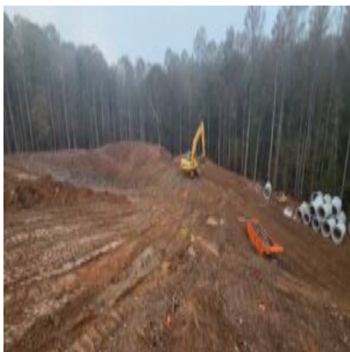
NW pond area by lots #22- #25