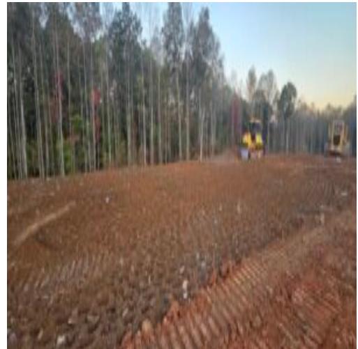
lots 23 - 25