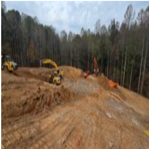
blasted area and pond excavation

We appreciate the opportunity to be of service to you on this project. If you have any questions regarding this report, please feel free to contact us. We will be more than happy to discuss it with you.