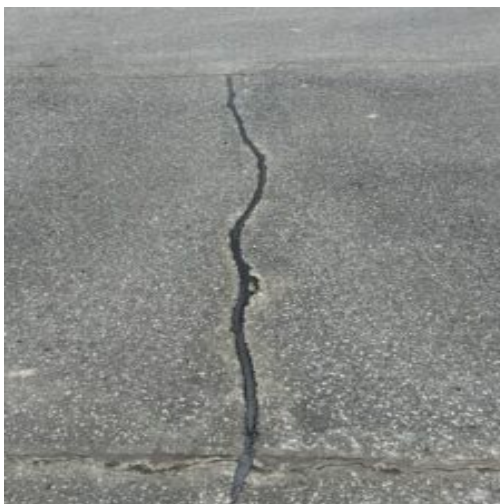
Asphalt cracks cut and filled

We appreciate the opportunity to be of service to you on this project. If you have any questions regarding this report, please feel free to contact us. We will be more than happy to discuss it with you.