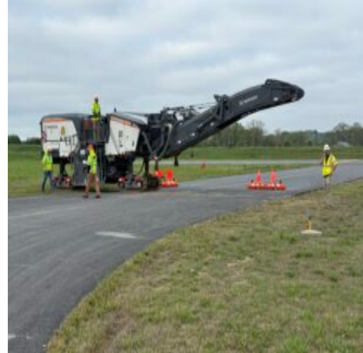
Additional milling throughout airport