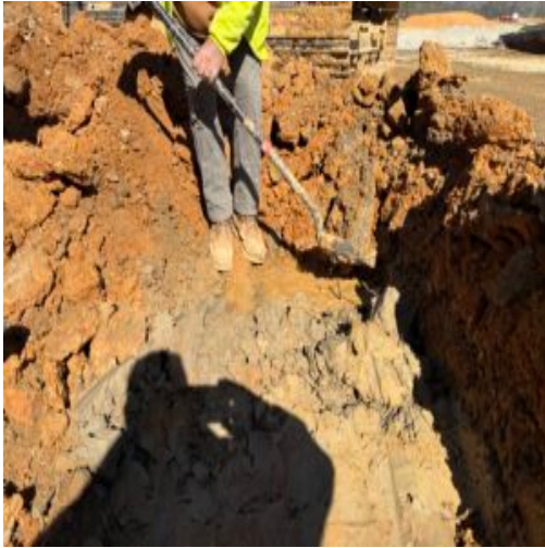
Wet area from water line