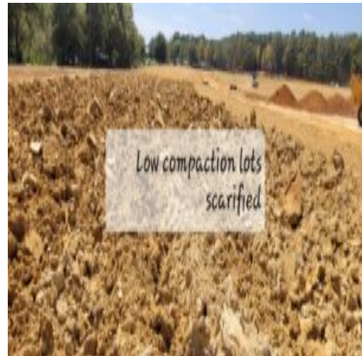
Above pic showed Lots#62-67 being ploughed to be scarified and repacked