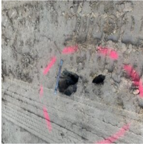
Drill rock holes with voids, recommended to fill with #89 stone