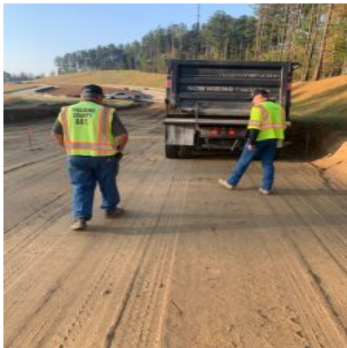
Proof roll of sub grade

We appreciate the opportunity to be of service to you on this project. If you have any questions regarding this report, please feel free to contact us. We will be more than happy to discuss it with you.