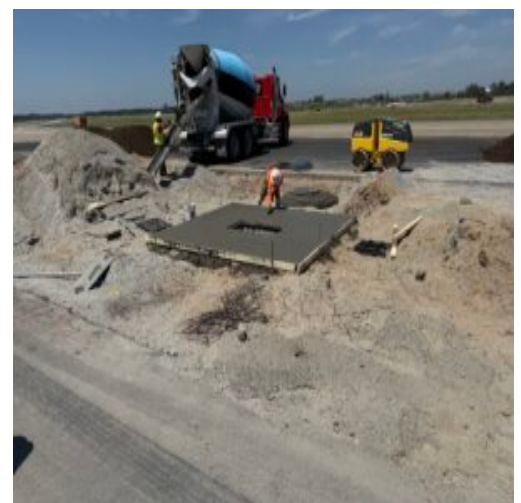
Placed concrete Collar area 1