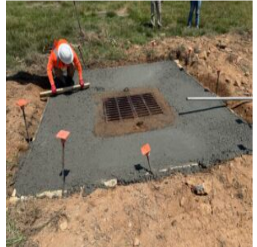
completing collar next to flume