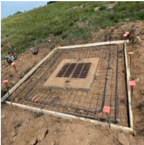
Formed/rebar Collar next to flume observed by 2MNext and AtlNext before concrete placement.