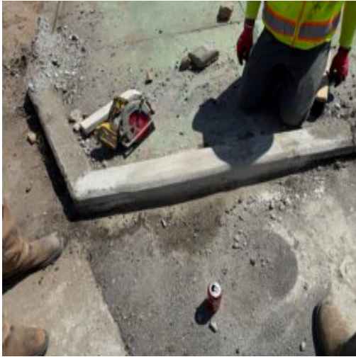
Curb repair area 1