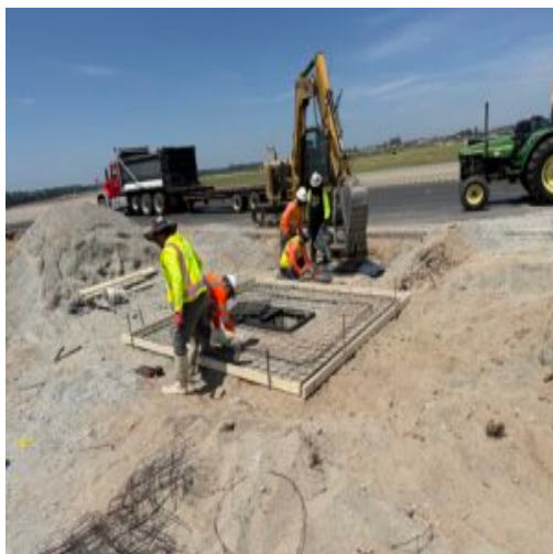
form/rebar collar area 1 observed by 2MNext and AtlNext before concrete placement.

A cultipacker was utilized to prepare the surface prior to sod placement.