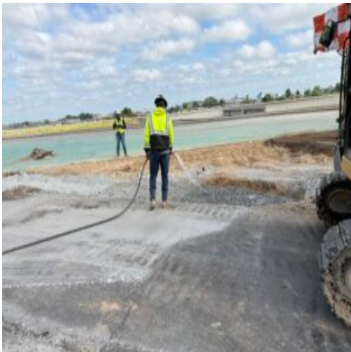
Adding water to GAB