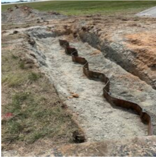
Sheet piles cut below grade