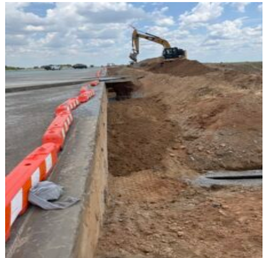
Backfilling Area 4