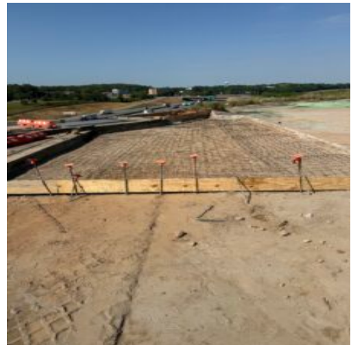
New concrete area