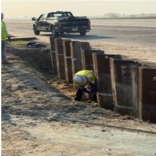
Sheet Piles being cut down