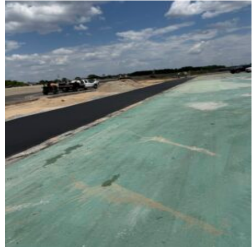
Asphalt paving Area 1