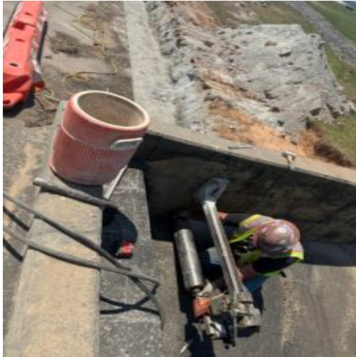
Area 5 Hole drilled through wall for drain