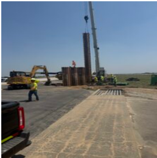
Sheet piling installation