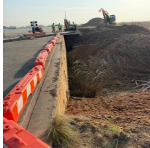
Area 3 trench