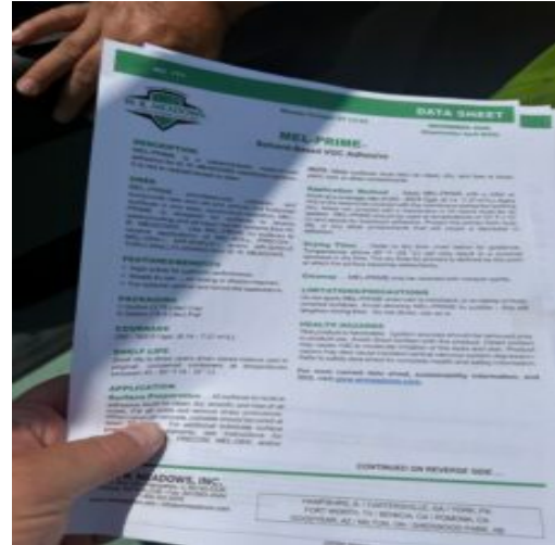
Waterproof specification sheet