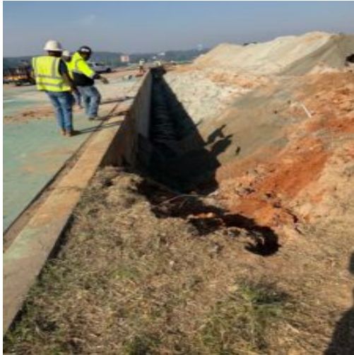
Area 2 excavation