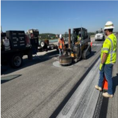
Coring around existing Lights