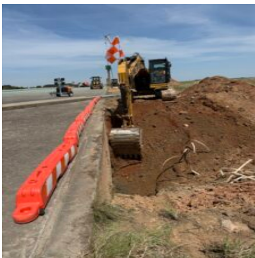
Area 4 excavation