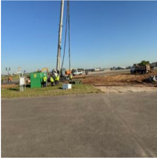
Sheet pile installation