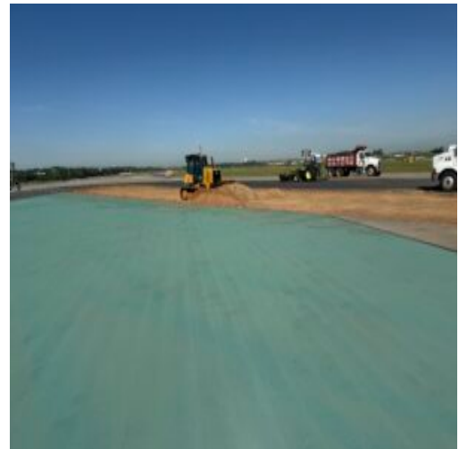
Preparing for GAB Area 1